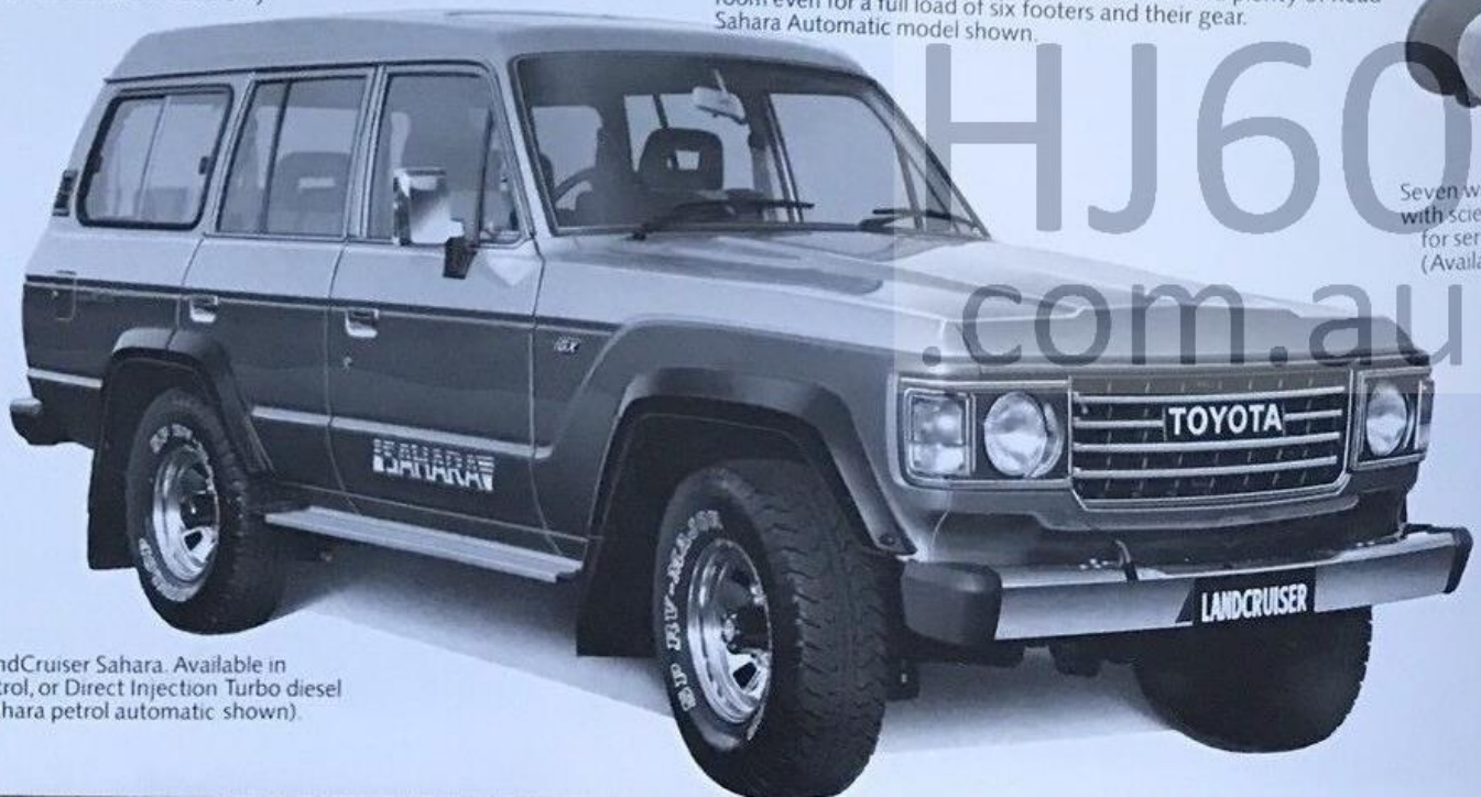
LandCruiser Sahara. Available in petrol, or Direct Injection Turbo diesel (Sahara petrol automatic shown).