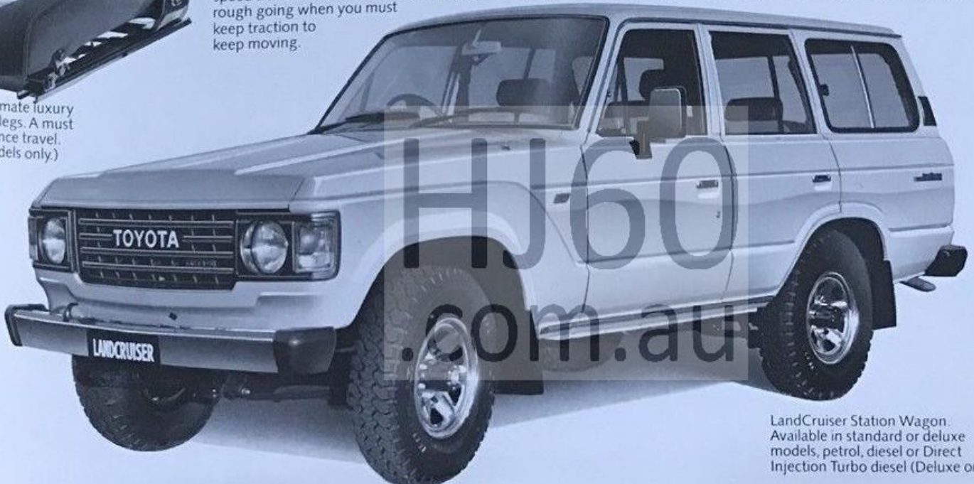
LandCruiser Station Wagon. Available in standard or deluxe models, petrol, diesel or Direct Injection Turbo diesel (Deluxe only)