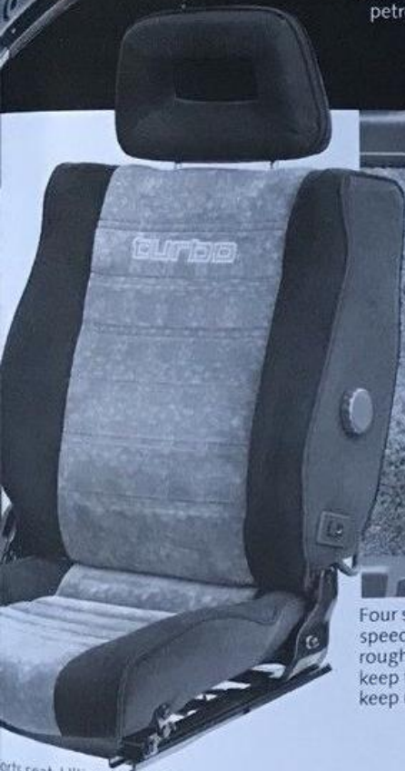
ports seat. Ultimate luxury for bodies and legs. A must for long distance travel. (Automatic models only.)

When planning your personal LandCruiser study the list of options and equipment overleaf carefully. And if you need knowledgeable advice your Toyota Dealer will be glad to help you.