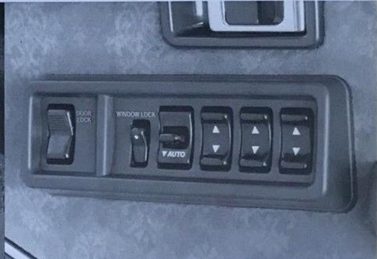
Power windows and doorlocks. You close up and open the entire vehicle from the driver's seat. Individual window controls from each door. (Sahara models only.)