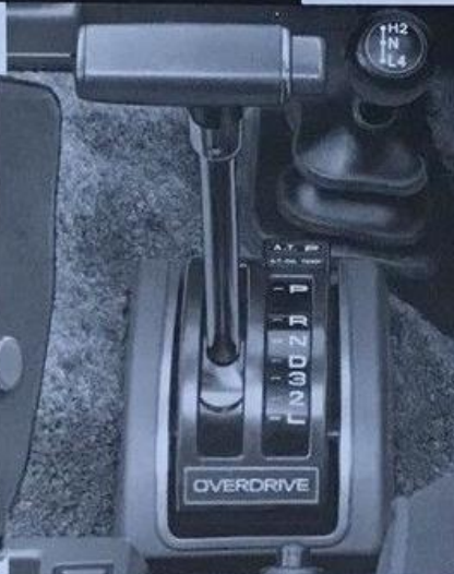
Four speed automatic transmission and two speed transfer case. A terrific advantage in rough going when you must keep traction to keep moving.