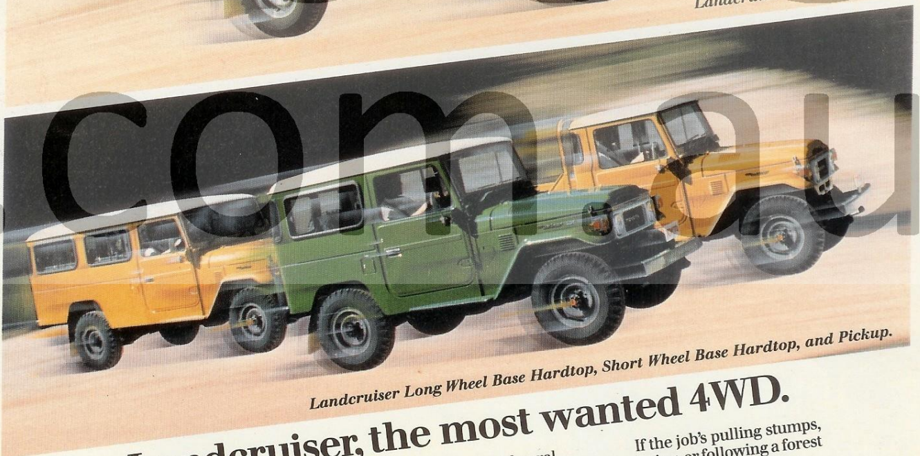
Landcruiser Long Wheel Base Hardtop, Short Wheel Base Hardtop, and Pickup.